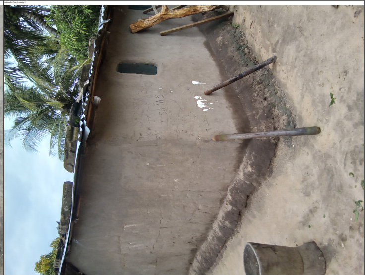
Figure 1: Photographs of the traditional mud-brick building. The left image shows the exterior view of the building with a thatched roof and a small window. The right image shows a closer view of the building's wall and roof structure.